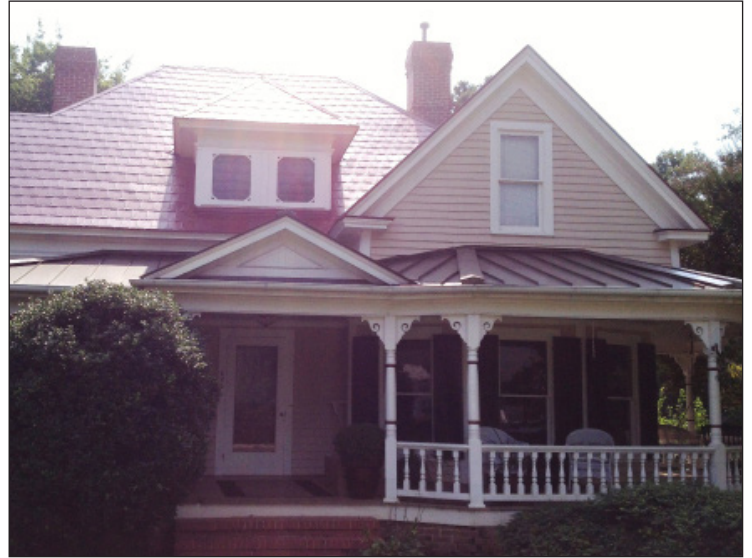
Armour-Adams House