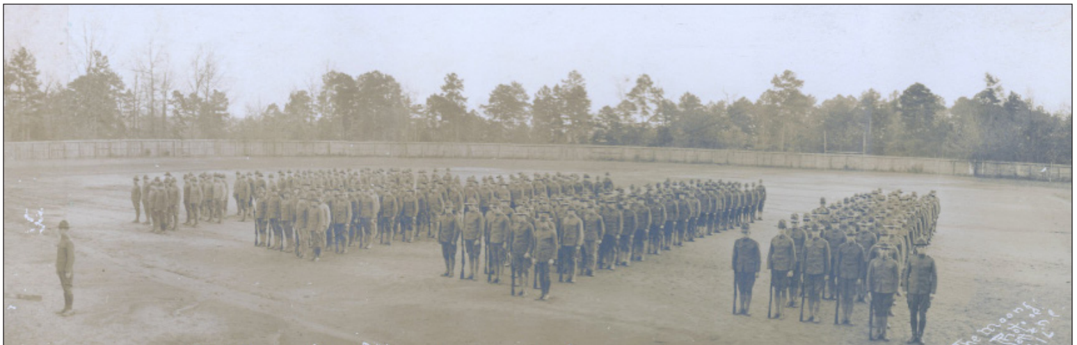
Davidson College S.A.T.C.