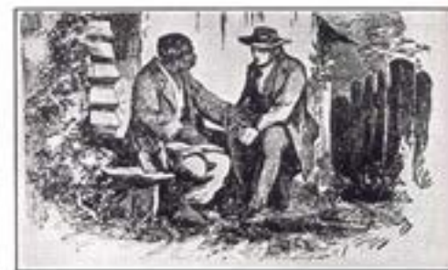
ERRING THE WANDERER IN THE RIGHT WAY.

The experiences of slaves with regards to Christianity varied significantly depending on the slave owner and their particular feelings towards the religious education of slaves, although regardless of how the master felt about religious education of slaves, many slaves adopted Christian beliefs and would go out of their way to celebrate their faith, even if it meant possible punishment by masters. The intersection of slavery and religion also became a significant topic of consideration for the hierarchy of the Presbyterian Church, which was regionally divided as to whether or not Church doctrine allowed for the justification of slavery. In almost every instance the experience of slavery was affected in some way by Christianity.