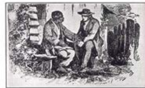
ERRING THE WANDERER IN THE RIGHT WAY.

The experiences of slaves with regards to Christianity varied significantly depending on the slave owner and their particular feelings towards the religious education of slaves, although regardless of how the master felt about religious education of slaves, many slaves adopted Christian beliefs and would go out of their way to celebrate their faith, even if it meant possible punishment by masters. The intersection of slavery and religion also became a significant topic of consideration for the hierarchy of the Presbyterian Church, which was regionally divided as to whether or not Church doctrine allowed for the justification of slavery. In almost every instance the experience of slavery was affected in some way by Christianity.