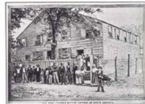
Photo Courtesy of Carter Godwin Woodson in The History of the Negro Church . 1921

For more information and to see more photos on slavery in Mecklenburg County, please visit the University of North Carolina's online database Documenting the American South at docsouth.unc.edu .