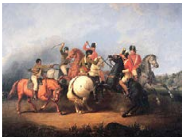
Depiction of the Battle of Cowpens. Painting by William Ranney. 1845