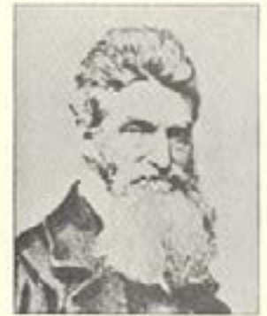
JOHN BROWN. PURITAN HERO, CHRISTIAN PHILOSOPHER, MARTYR FOR THE SLAVES.

The institution of slavery in a region that was so heavily influenced by Christianity caused an important dilemma for slave owners. In Mecklenburg County, many of these slave owners were also Presbyterian ministers. The high levels of the Presbyterian Church, which was based in Pennsylvania, generally disapproved of the