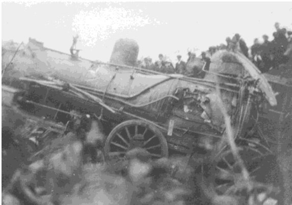
Train Wreck in Davidson, 1914

Please join the Davidson Historical Society for an afternoon of history and refreshments at the Brickhouse Tavern, located in the refurbished, 120-year-old Davidson Cotton Mill.