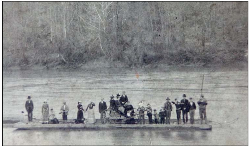
Ferry Crossing the Catawba River, circa 1900

every surface is covered with countless photographs and artifacts, portraying the fledgling town of Cornelius as it developed across the span of more than a century. Some of Jack's earliest pictures date back to the turn of the 20 th century and portray common occurrences like a ferry on the Catawba River and local landmarks like the Cornelius cotton mill.